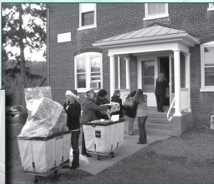
A group of employees from Air Products in Allentown delivers its annual gifts for children served by Diakon Adoption & Foster Care.