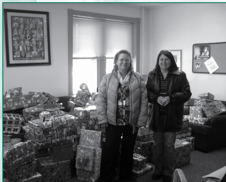
Staff from Buckeye Partners, L.P. in Breinigsville, Pa., stand among a mountain of gifts donated by employees of their company.

Local groups and Christmas gifts for Diakon Adoption &