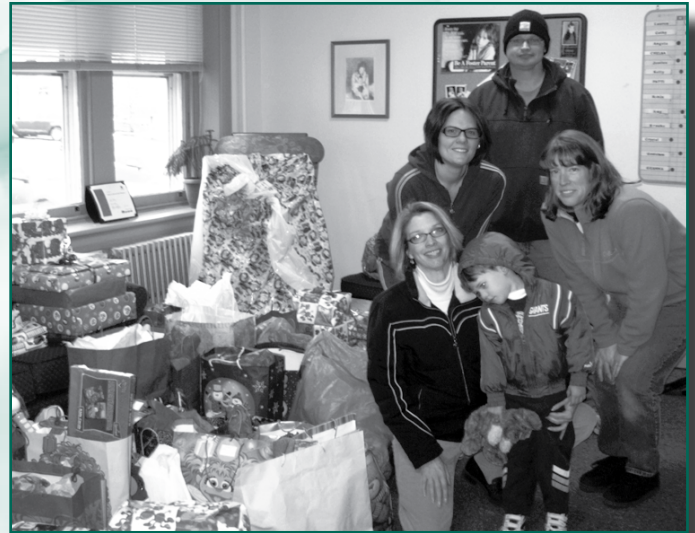
Staff and family of Concordia Preschool bring their annual donation to Diakon Adoption & Foster Care in Tipton.

Local groups and Christmas gifts for Diakon Adoption &