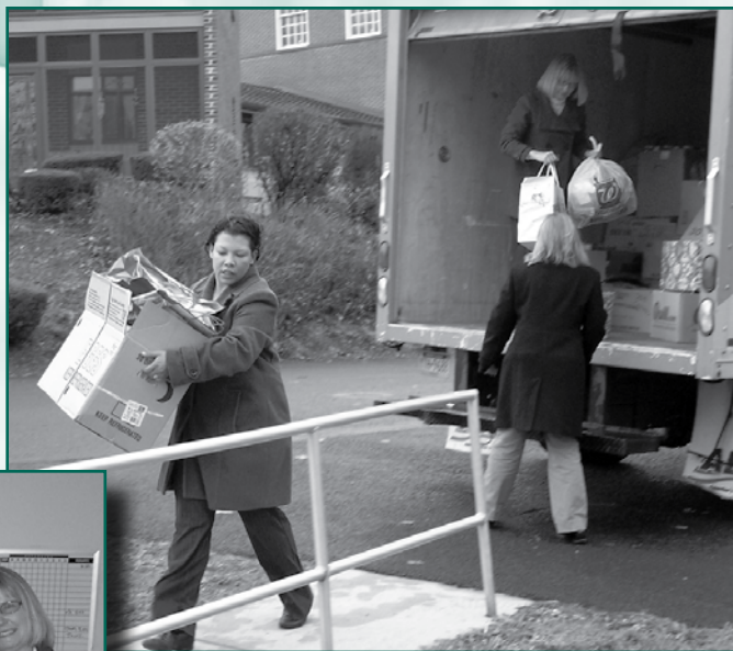
Diakon Adoption & Foster Care staff unload a truck with gifts for foster children from the Lehigh Mission District ingathering. O'Brien Moving & Storage Company assisted by providing a truck and a staff person to help. The mission district is a local Lutheran church jurisdiction.